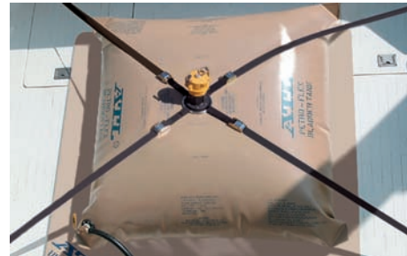
Optional Tie-Down Kit with Collar and 4 Straps. Underliner Standard.

*Use your ATL Petro-Flex Range Extender Tank only in compliance with State and Federal Regulations.