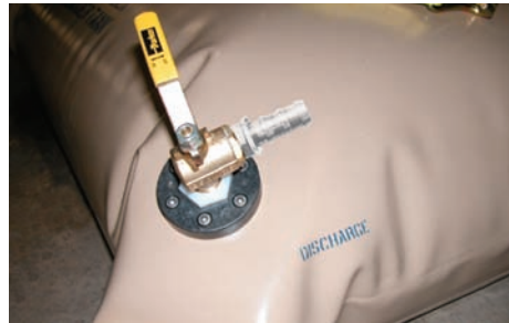
1" Outlet, Reduced to ½" (12mm) Ball Valve and Barb