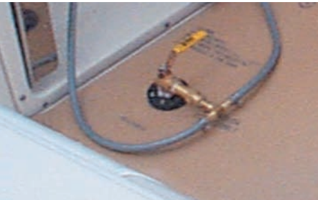
Optional "T" Outlet, Refills 2 Tanks Simultaneously