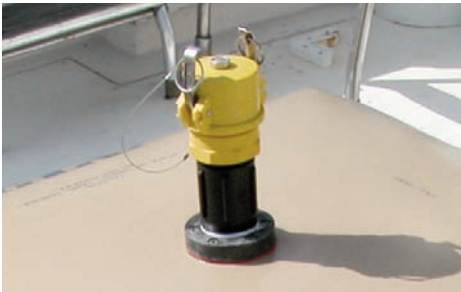
Stand Pipe & Safety Cap with Pressure Relief Valve, 8½" h X 2" dia. (50mm)

Unfold on Flat Surface. Fill, Fasten Cap, Strap Down. Refills "Mains" by Gravity, Siphon or Pump.