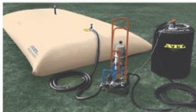
2000 Gallon Petro-Flex, 2X2 Pump and ATL Drop Drum