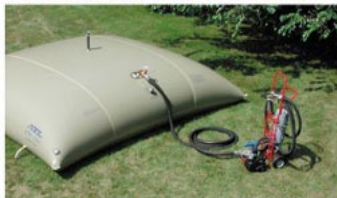
5000 Gallon Petro-Flex and 2X2 Pump