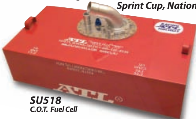
SU518 C.O.T. Fuel Cell