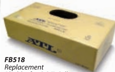
FB518 Replacement Bladder for C.O.T. Cell See below