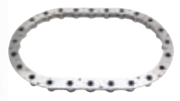
Hi-Vent Billet Aluminum Nut-Ring Standard on ALL COT Bladders!