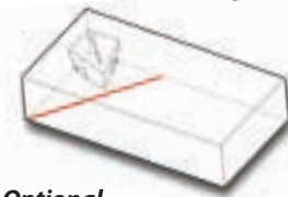
Optional Ramp/Wier on Bladder Floor. Choose our style or send us your own. (Approvals required)