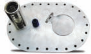
TF724 ATL's NEW State-of-the-Art NASCAR Fill Plate for the Fastest Fill in the Pits! See Pg. 21