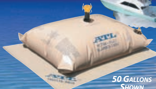
50 GALLONS SHOWN