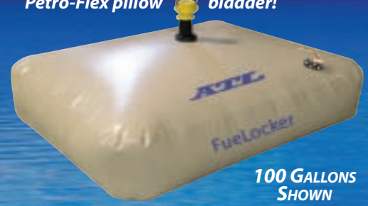
100 GALLONS SHOWN