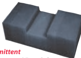
BF922C shown See Pg. 27

Conductive Safety Foam Baffling Gas Only & E-100 Intermittent