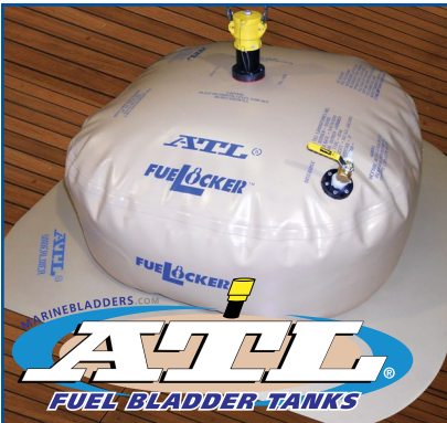
ATL collapsible fuel lockers can be easily secured to cockpit decks or custom fitted to stow away in below-deck compartments.

A: A long-range fuel bladder may be just the thing to help get you there. The Yacht Doctors have received excellent feedback from ACY customers that have used