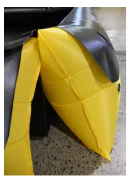
Each Support Tube should be set at about a 30° angle from vertical (toward the liner).